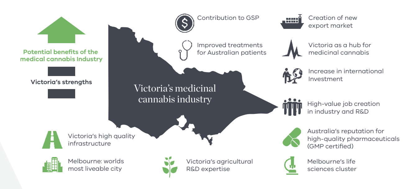
Figure 2: Benefits of a strong medicinal cannabis industry

Alongside the critical health benefits for patients, developing this new industry would generate a wide variety of direct and indirect benefits for the State. Some of these are shown in as shown in Figure 2 below.