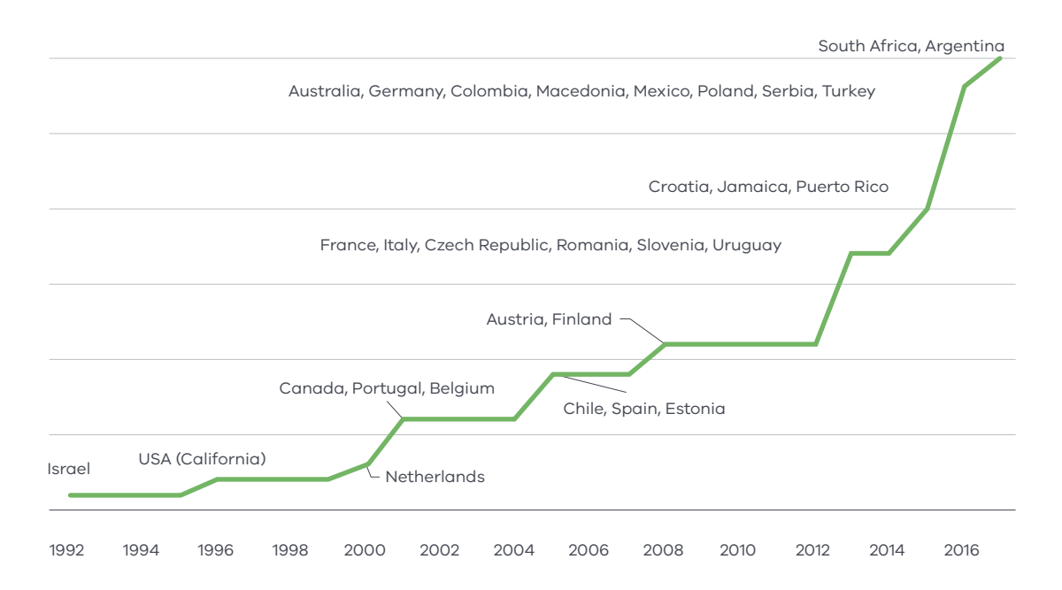
Figure 1: Legalisation of medicinal cannabis globally

To date, global exporters of medicinal cannabis have been confined to the Netherlands, United Kingdom, United States and Canada. These suppliers have emerged in large part because of a supportive policy environment.